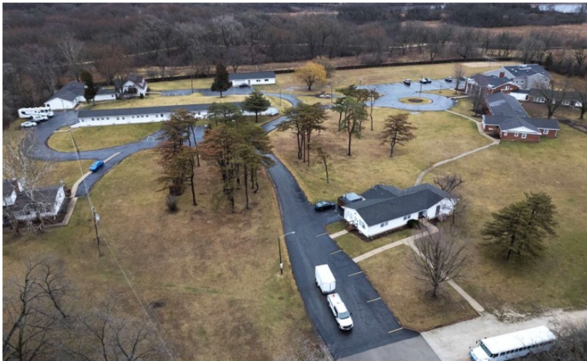
The Dayspring Bible College and Seminary campus on Fairfield Road north of Route 176 near Wauconda is being acquired by the Lake County Forest Preserve District for $4 million.

Church leaders met with residents in neighboring subdivisions to discuss the vision and hosted an open house and barbecue before making the case to the village's advisory plan commission and zoning board of appeals. Approval was unanimous and the village board followed suit.