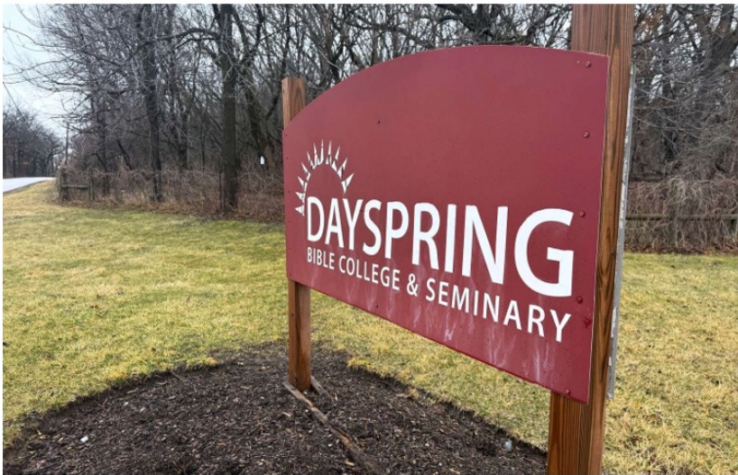
The Dayspring Bible College and Seminary campus on Fairfield Road north of Route 176 near Wauconda is being sold to the Lake County Forest Preserve District for $4 million.